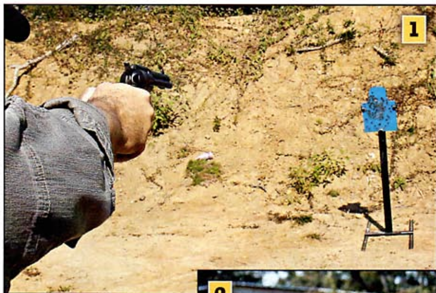
1) The author trains with steel Hi-Power Silhouette from PortaTarget. 2) All SA revolvers require dedicated practice to master. 3) Cowboy ammunition came from Black Hills and Winchester.